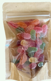
ORGANIC GUMMY WORMS