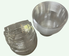
CUPS WITH LIDS