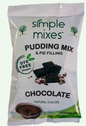
CHOCOLATE PUDDING MIX