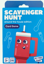
INDOOR SCAVENGER HUNT