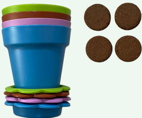
MINI PLANTERS & COCO COIR PELLETS