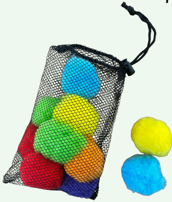
REUSABLE WATER BALLOONS