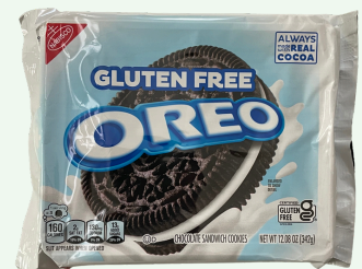
GLUTEN FREE OREOS